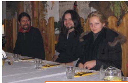
▲ Last dinner after the Workshop ▼